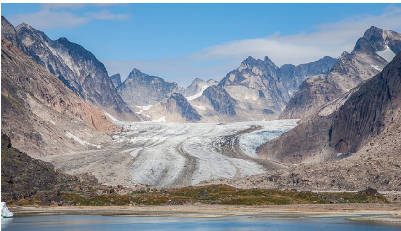
Prins Christiansund, Greenland.