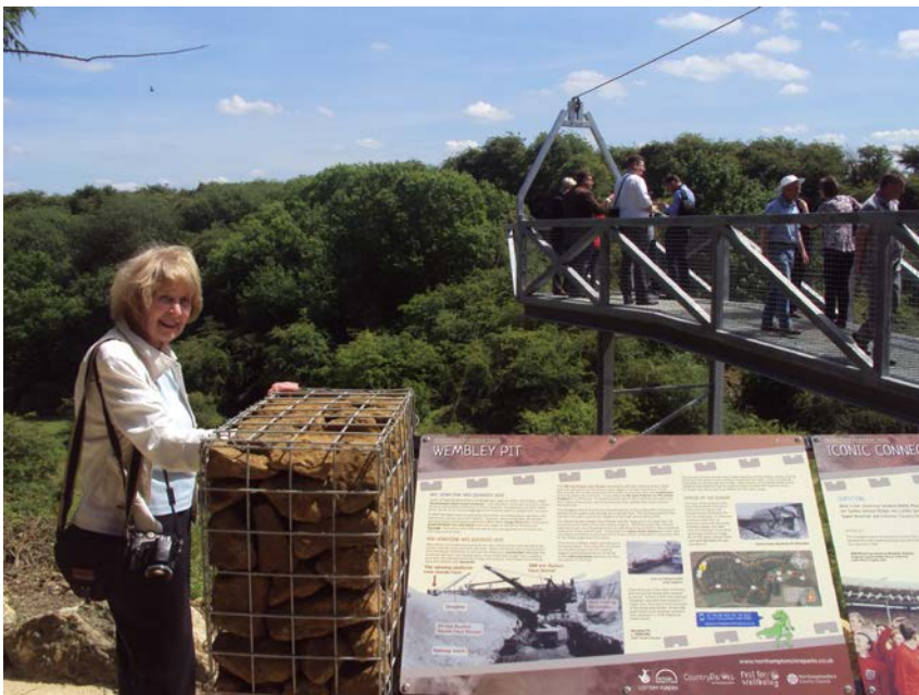
Ironstone Trail Irchester Northants.

Protecting sites in order to support scientific research and education has been a major justification for geoconservation in Britain, but the wider social and economic benefits that also arise are increasingly important; geoconservation is essential to geoscientists but it is also relevant to society in general. This talk will examine both the history of geoconservation in Britain, and the activities and initiatives that are taking place today, for example the work of UNESCO Global Geoparks, in order to explore the motivation behind it and the benefits for both science and society that have arisen through time as a result of local, national and international geoconservation activity. It will explore the challenges faced and the