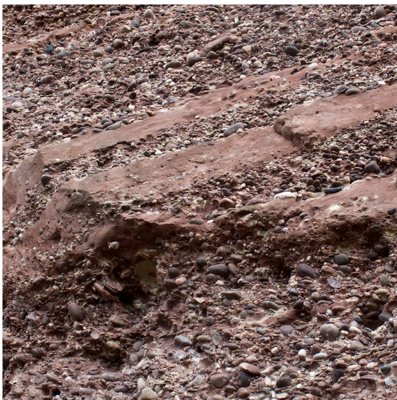
Park Hall Conglomerates.

Please meet at the visitor centre car park, off Hulme Road, Weston Coyney at 10am OS grid reference SJ 930447