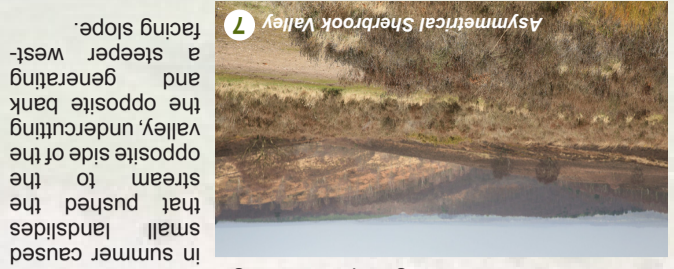
7 Asymmetrical Sherbrook Valley facing slope.

sections of valleys like the Sherbrook 8 are also characteristic of the asymmetric cross-valleys and the dissected nature of the plateau. The occurrence of dry weathering breaking up the sandstones, explains the influence of freeze-thaw combination with the brief summers. This, in surface drainage when snow melted during the development of permafrost subject to cold conditions similar to northern Canada today. The