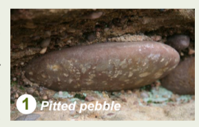
1 Pitted pebble

By the Triassic, Britain had moved to the northern desert latitudes. The pebbly Kidderminster Formation was deposited in a large braided river flowing northwards from mountains located in Northern France. The liver coloured quartzite pebbles are believed to have originated there and very rare limestone pebbles have been found to contain fossils from the Ordovician period of Brittany. Other pebbles include white vein quartz used in glass making, pink rhyolites and black basalts. The Kidderminster Formation is both an important source of aggregates and water.