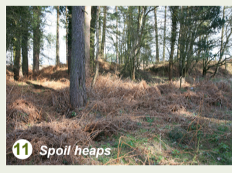
11 Spoil heaps

The rocks of Cannock Chase belong predominantly to the Triassic Period (here 250-245 million years old). These overlie the Upper Carboniferous Coal Measures (314-312 million years old) separated by a 60 million year unconformity during which the older rocks were deformed, uplifted and eroded.